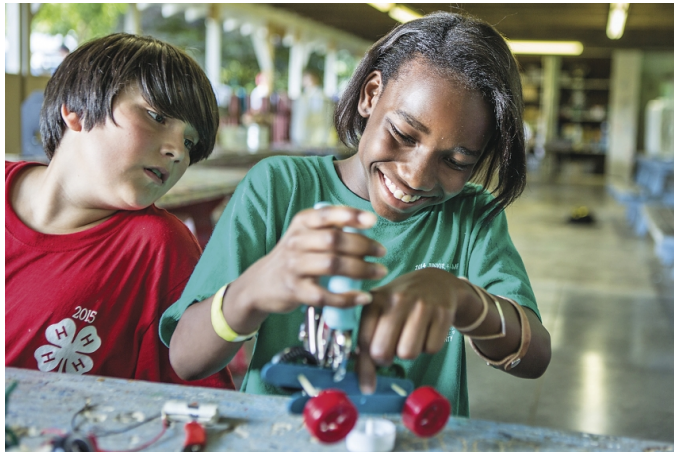
NATIONAL 4-H COUNCIL, TENNESSEE

IF YOU BUILD IT, THEY WILL COME: With classes like Junk Drawer Robotics, in which 4-H members create their own automatons, the venerable youth charity is boosting its appeal to modern kids.