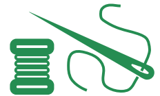
Needle & Thread